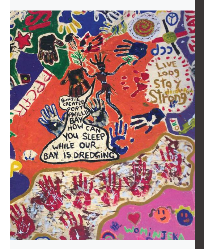
Artwork created by members of the community for the Homeless Memorial

< Cover photos: Smoking Ceremony at the Homeless Memorial and Acland Grange SRS creative workshop, Staff walk for Active April